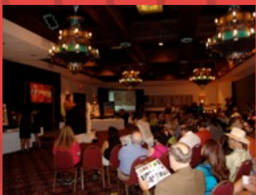
NARF Auction 2006, La Fonda Hotel