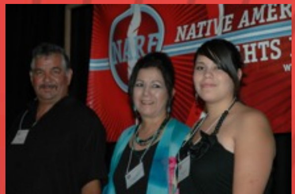
2006 Featured Intergenerational NARF Auction Artists

NARF's annual Visions for the Future Benefit Art Auction is now in its 7th year. It is NARF's biggest and most important special event of the year that helps to raise much needed support and awareness for Native Americans rights. All proceeds benefit NARF's non-profit legal and advocacy work on behalf of Native Americans throughout the United States.